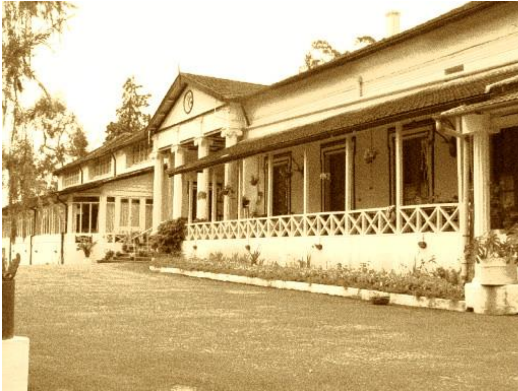
The Ootacamund Club